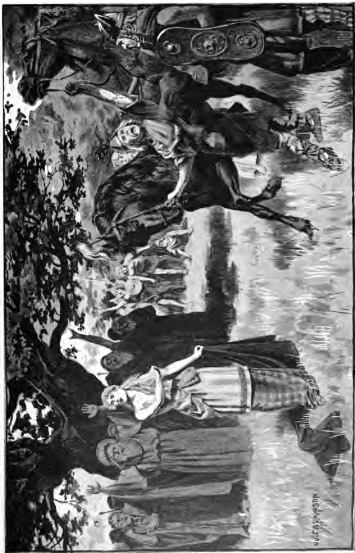
BOADICEA SHOWS THE MARKS OF THE ROMAN RODS